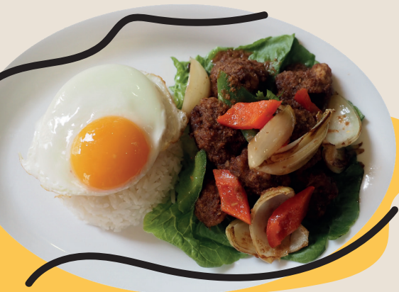
Wok-fried Sa Cha Pork

Fragrant steamed rice with vegetable, seafood & egg gravy