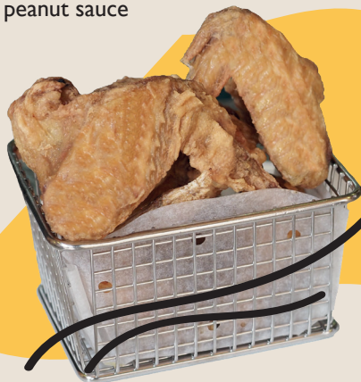
Deep-fried Chicken Wing