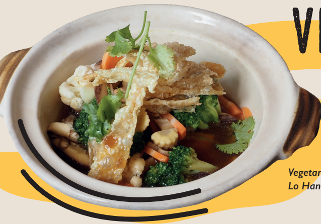
Vegetarian Lo Han Chai