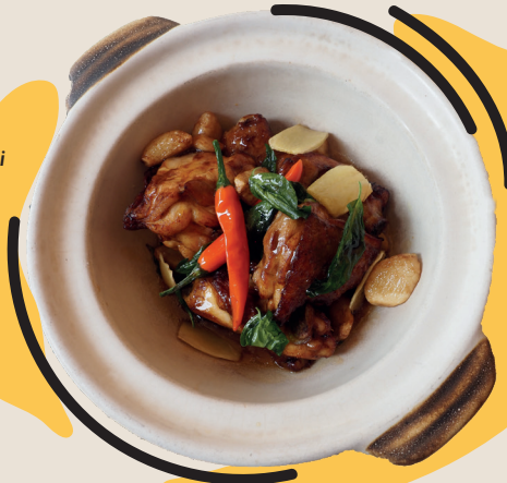
Claypot San Bei Ji