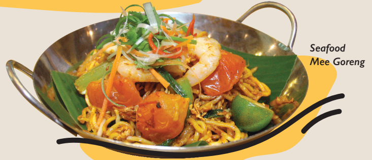
Seafood Mee Goreng