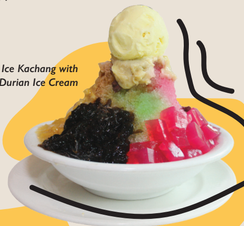
Ice Kachang with Durian Ice Cream

Sweet longan soup with red date, white fungus, ginkgo nut & lotus seed (served hot or cold)