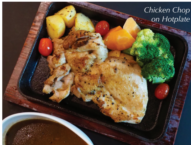
Chicken Chop on Hotplate

$10.90 w/GST each Crayfish Laksa Chicken Chop on Hotplate