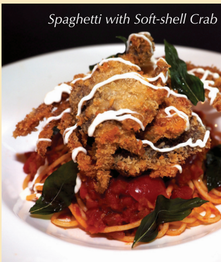
Spaghetti with Soft-shell Crab

$10.90 w/GST each Curry Chicken with Yellow Noodle Spaghetti with Soft-shell Crab