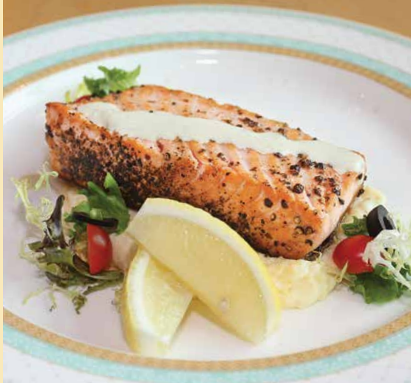
Pan-seared Salmon with Cream Sauce

Available from 12 noon to 9.00pm, Monday to Friday in February, except Eve of Public Holidays & Public Holidays.