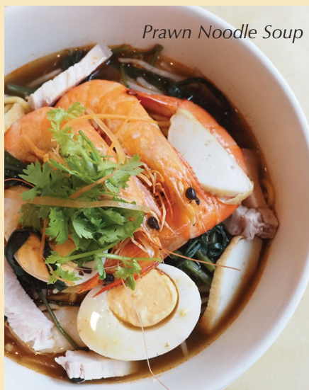
Prawn Noodle Soup