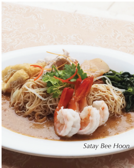
Satay Bee Hoon